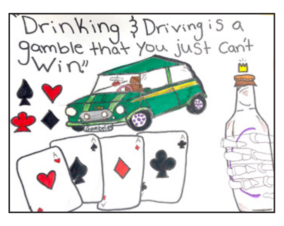
Ciara Trigilio , 7<sup>th</sup> grade, won first place in the 6<sup>th</sup> - 8<sup>th</sup> grade category.